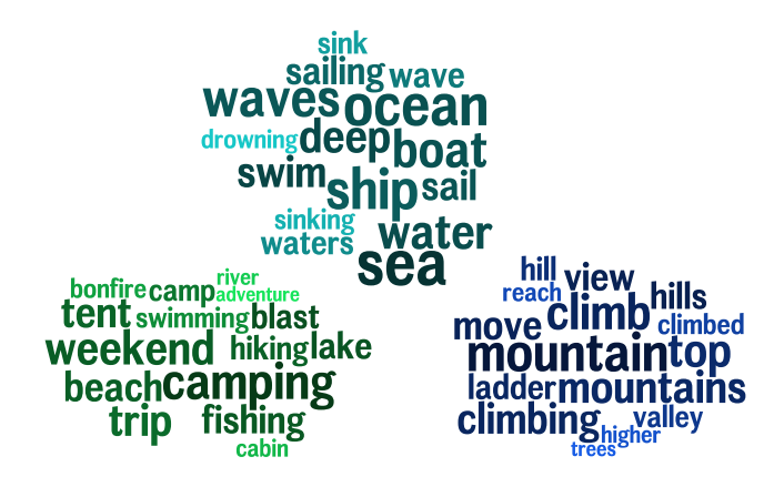
Figure 3: Three outdoor / nature activity topics positively correlated with well-being. Word size corresponds to prevalence within the topics. Topics are significantly correlated with LS at a Bonferroni-corrected p < 0.001.

"tired", "bored"), and conversely, words associated with the "engagement" ('excited') construct emerge as some of the strongest positive predictors. In regard to (dis)-engagement, curated dictionaries and LDA topics tell the same story. Sets of words tied to positive and negative emotions (Pennebaker et al. 2007) show the predicted correlations with life satisfaction; the same is true for the LIWC subdictionaries which represent swear words and expressions of anger.